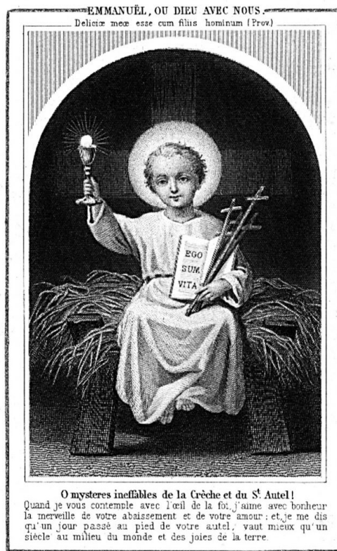
Holy card expressing devotion to the Child Jesus.

"His holiness was so overwhelmingly apparent that at times he inspired sinners to repentance merely by the sight of him."