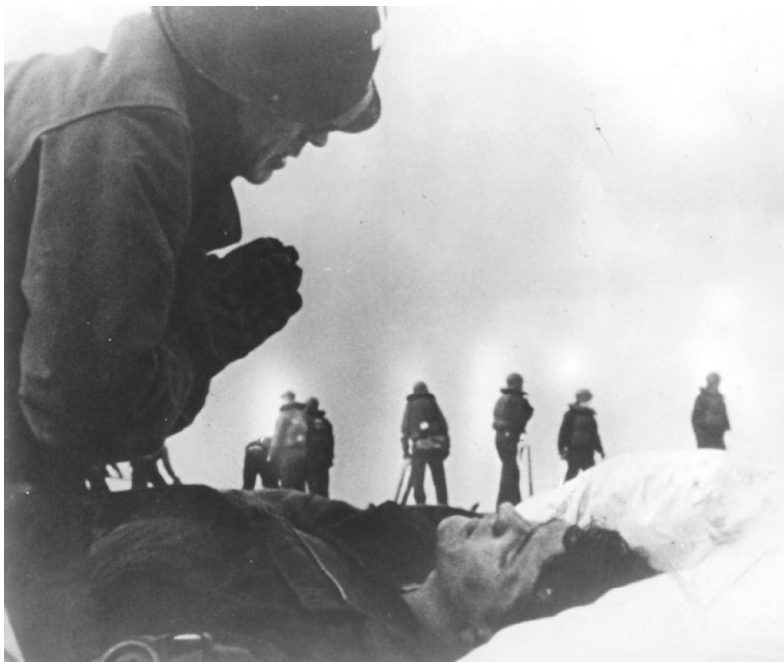
A military priest prays over a wounded soldier during World War II

St. Paul exclaims, “Rejoice always, pray constantly, give thanks in all circumstances; for this is the will of God in Christ Jesus for you” (1 Thes 5:17). The command to pray without ceasing may seem impossible,