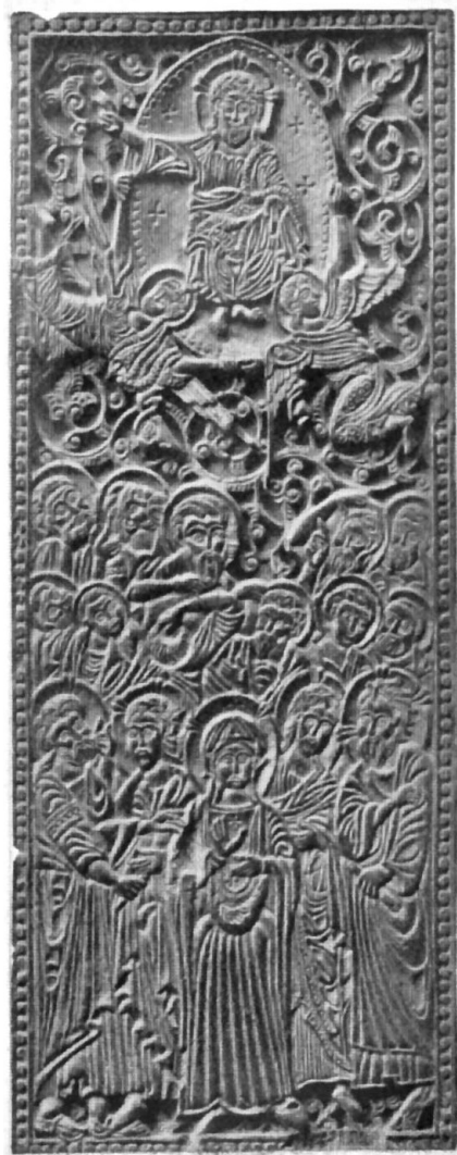
The Ascension of Christ, 15th century cedar panel from Egypt

"God permits evil, and brings good from it, but is not the source or cause of evil."