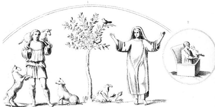
The Good Shepherd, the Blessed Virgin Mary, and Noah with a dove symbolically represented, 3rd century frescoes in the catacombs near Rome

The story of creation in the book of Genesis is