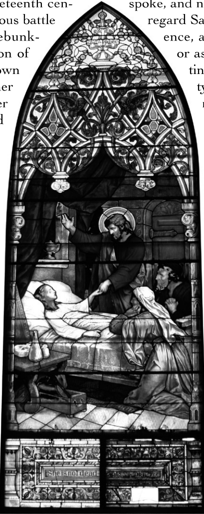
Jesus raising Jairus' daughter

“The story of creation was not intended as a scientific description of events no one could possibly have witnessed.”