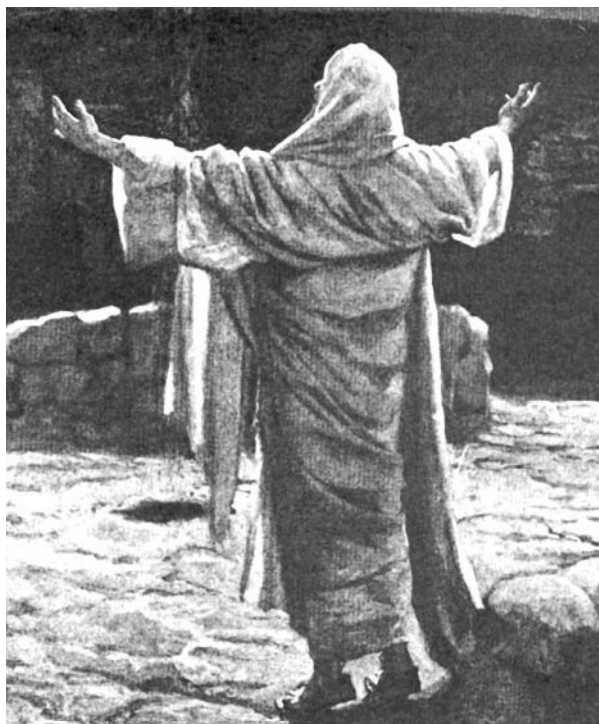
Christ going to the Mount of Olives at night, by James Tissot, 1856-1902

tends to deny that there is such a thing as real right and wrong. It tends to equate whatever one likes with being right and good, and whatever one doesn't like with being wrong and bad. How on earth did we get such an idea of human freedom? To answer this question, we must turn to consider what kind of morality lies behind this understanding of human freedom.