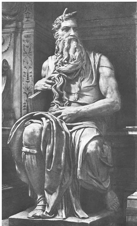
Statue of Moses, by Michelangelo Buonarroti, 1475-1564

The book of Exodus opens with the initial prosperity of the Israelites in Egypt and their later enslavement. Yet “the more they were oppressed, the more they multiplied” (Ex 1:12). Eventually this led the Pharaoh (the ruler of Egypt) to order the murder of every boy at birth (see Ex 1:15-22). It was to this generation of children that Moses was born, and saved through the ingenuity of his mother and sister and the pity of one of Pharaoh’s daughters (see Ex 2:1-10). Grown to manhood, Moses murdered an overseer who was beating a Hebrew slave, and