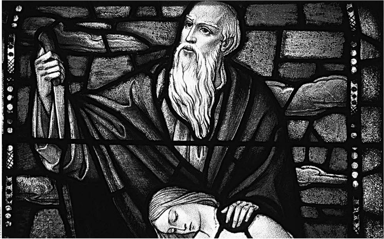
Abraham willing to sacrifice his son Isaac

bless you, and make your name great, so that you will be a blessing. I will bless those who bless you, and him who curses you I will curse; and by you all the families of the earth shall bless themselves” (Gn 12:2-3). We see in this wonderful promise the seed not only of God’s Chosen People, the Israelites, but of the Church itself.