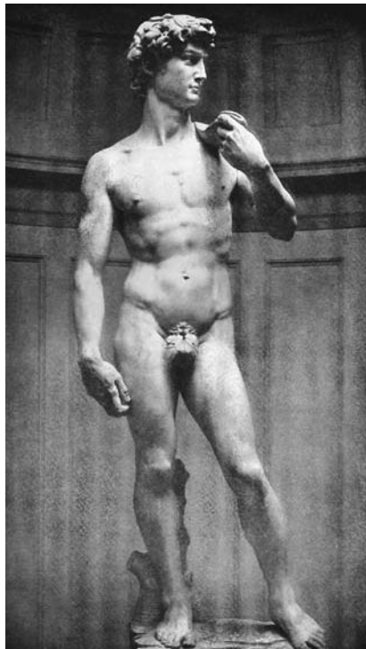
Statue of David, by Michelangelo Buonarroti, 1475-1564

“It is with the great King David that God seals the last of the Old Testament covenants.”