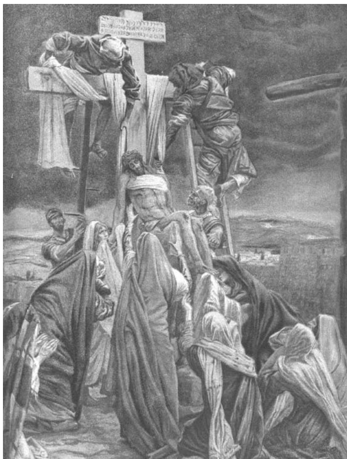
The descent from the Cross, by James Tissot, 1856-1902

“God willed that redemption be realized in the most perfect and fitting manner possible.”