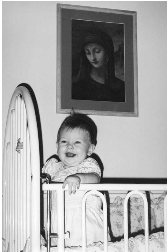
Mary is our Mother in the order of grace

in the beginning and sanctified by Christ through the sacrament of Matrimony. Her virginity is, rather, a sign of her singular devotion and total gift of herself to God. Because she is both virgin and mother, Mary's life is a supreme example of holiness to both those who are married and those who have made themselves virgins for the sake of the Kingdom (see Mt 19:12).