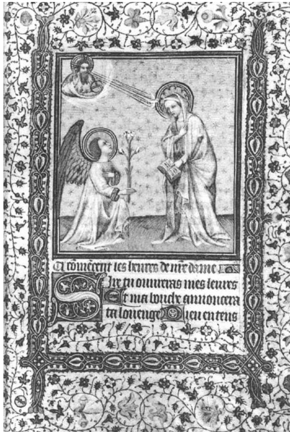
Annunciation of the Archangel Gabriel to the Virgin Mary, 15th century illuminated manuscript, French Book of Hours

"Mary is the woman out of all human history who was chosen by God the Father to give human flesh and blood to his divine Son."