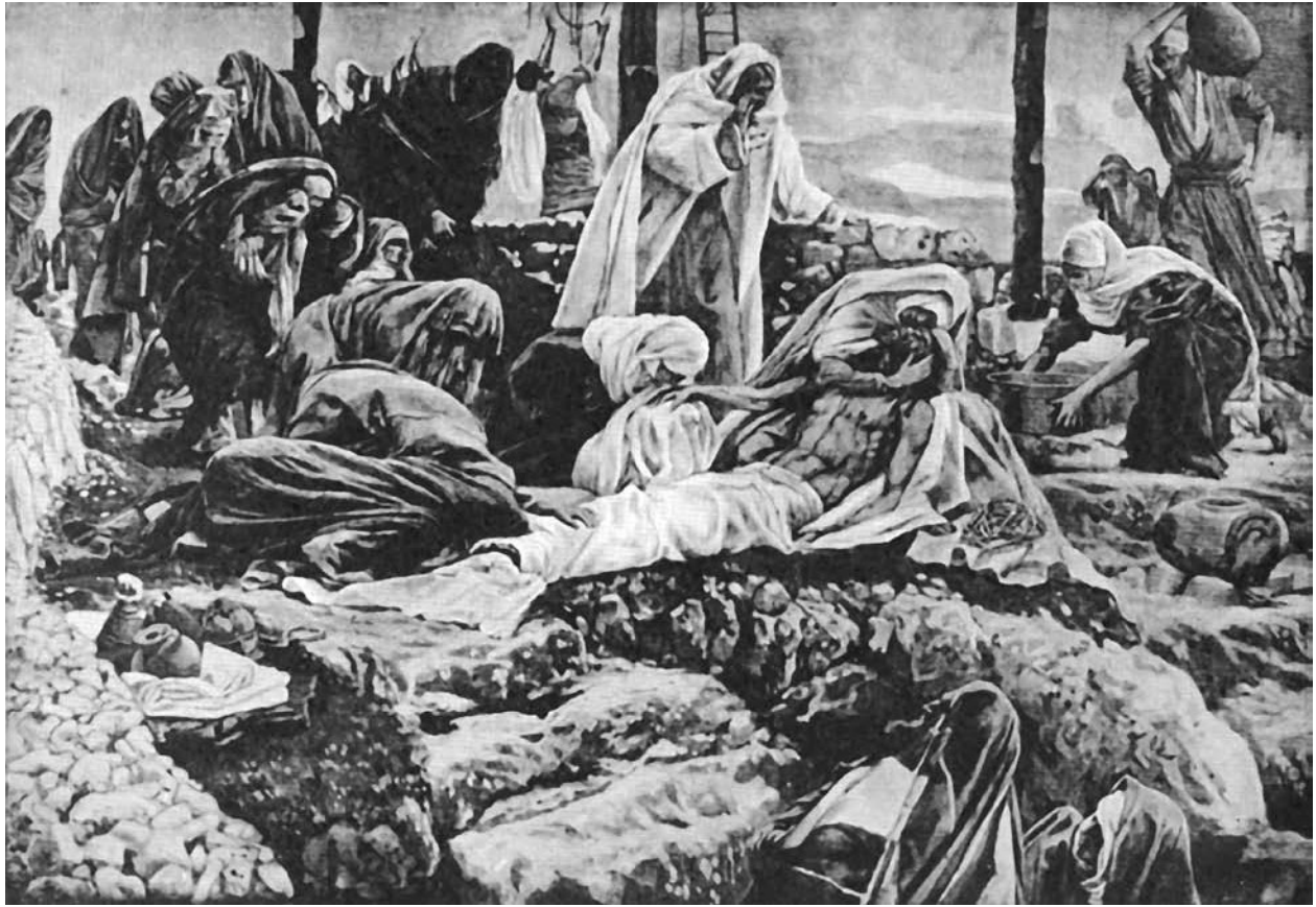
The Blessed Virgin receives the body of her Son, by James Tissot, 1856-1902

When God gives someone a high calling, he also gives the grace needed for it. There is no role that any human being has ever been called to that is higher than Mary's. She was called to be the Mother of Jesus Christ, who is God. The highest calling requires the highest grace. The doctrine of the Immaculate Conception does not in any way mean that Mary was not also redeemed by Christ. God is outside of all space and time, and therefore could easily redeem Mary in a unique way. The Church teaches, based on the teaching of Sacred Scripture and Sacred Tradition, that the merit and grace of Christ's redemption was applied by God to Mary at the very first moment of her conception in her mother's womb. In this way she was preserved from being born with original sin. She was given a sinless nature so that she could then give a sinless nature to her Son Jesus as a true human mother.