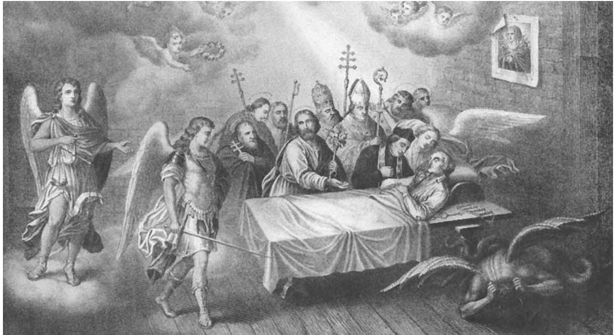
The Peaceful Death of the Just, 19th century lithograph

not force us to love him. He wants us to spend eternity with him — but the choice is ours. We have the chance to turn to Jesus while we are alive, but at the moment of death, our choice is frozen, suspended forever in time (see CCC 1021). We either die in friendship with the Lord or we die out of his grace, in persistent rejection of his love to the end. A person who dies in a state of mortal sin has made a tragic, yet free choice — and will spend eternity separated from God by his or her own choice.