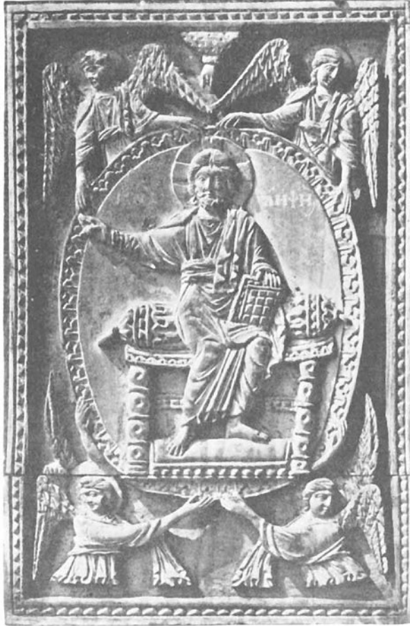
Jesus as Judge, 12th century carved ivory panel

a consoling positive reality; we do not have to die alone. The baptized Christian knows that his or her life belongs to Christ and that death is the physical completion of the “dying with Christ” that began at Baptism. Jesus opens up his own death to allow us to die with him; his obedience and love to God the Father can become our obedience: “For if while we were enemies we were reconciled to God by the death of his Son, much more, now that we are reconciled, shall we be saved by his life” (Rom 5:10).