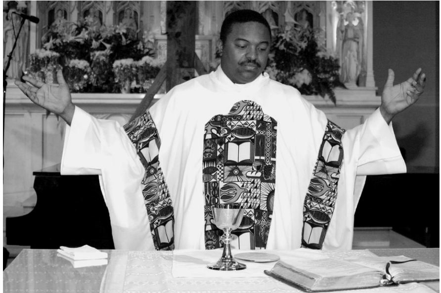
White vestments denote special times of celebration in the life of Church such as Easter and Christmas

The Church calendar has always revolved around the celebration of Easter and the