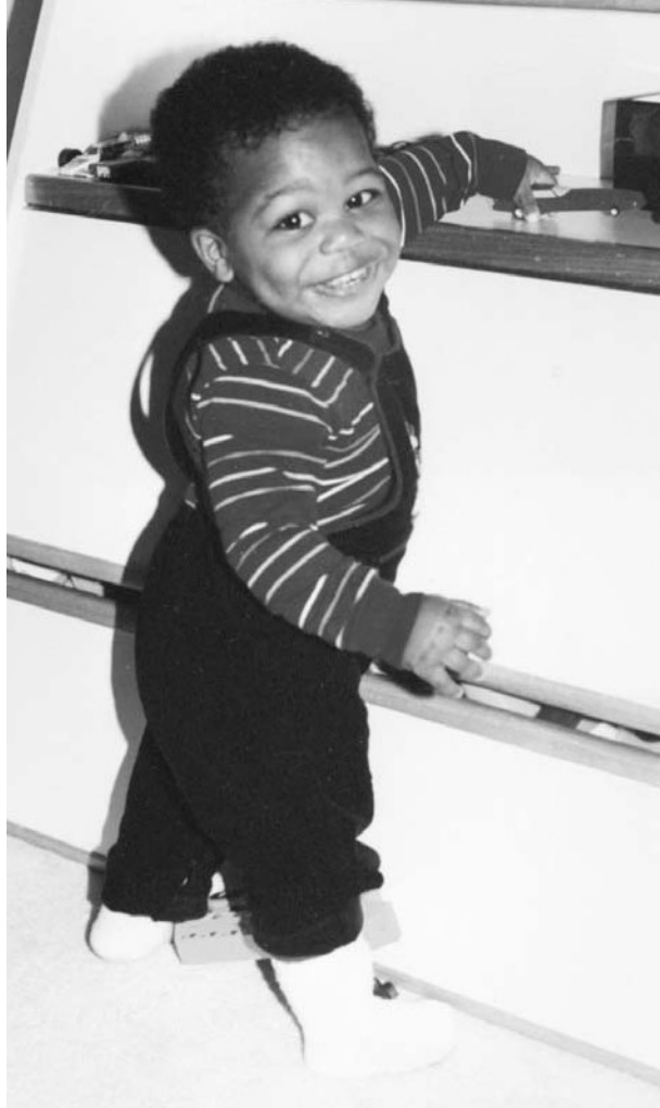
A child is always a blessing

artificial interference with conception is acceptable because, so it is supposed, human beings are mere biological beings. Yet Sacred Scripture teaches us that our bodies, like our souls, are holy to God: “Shun immorality. Every other sin which a man commits is outside the body; but the immoral man sins against his own body. Do you not know that your body is a temple of the Holy Spirit within you, which you have from God? You are not your own; you were bought with a price. So glorify God in your body” (1 Cor 6:18-20).