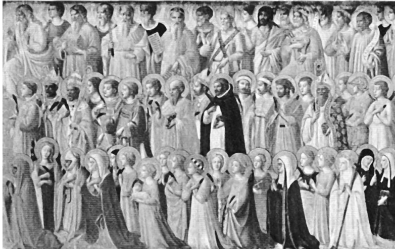
Saints from Predella, detail of the Madonna of San Domenico, by Fra Angelico, 1387-1455

And Mary said, "My soul magnifies the Lord, and my spirit rejoices in God my Savior; for he has regarded the low estate of his handmaiden. For behold, henceforth all generations will call me blessed; for he who is mighty has done great things for me, and holy is his name. And his mercy is on those who fear him from generation to generation. He has shown strength with his arm, he has scattered the proud in the imagination of their hearts, he has put down the mighty from their thrones, and exalted those of low degree; he has filled the hungry with good things, and the rich