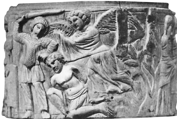
Martyrdom of St. Menas, 6th century ivory carving from Alexandria, Egypt

If he wished, God could eliminate all evil. He would accomplish this, however, only by removing free will from us. Without free will, though, we would no longer be truly human. We would no longer be kind or generous or thoughtful. We would no longer love, for love requires freedom. Due to our fallen nature and tendency to sin, evil will exist until the end of time, as Jesus tells us: "The Kingdom of Heaven may be compared to a man who sowed good seed in his field; but while men were sleeping, his enemy came and sowed weeds among the wheat, and went away. So when the plants came up and bore grain, then the weeds appeared also. And the servants of the householder came and said to him, 'Sir, did you not sow good seed in your field? How then has it weeds?' He said to them, 'An enemy has done this.' The servants said to him, 'Then do you want us to go and gather them?' But he said, 'No; lest in