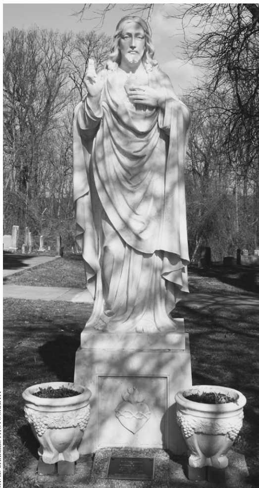
The Sacred Heart of Jesus, full of endless mercy

"The Lord's desire to save us is so strong that it extends even past the grave."