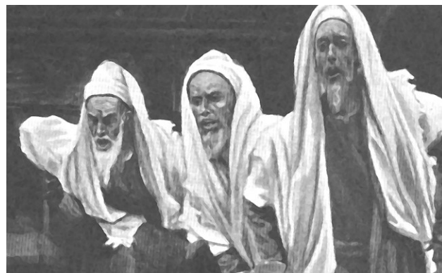
The Pharisees accusing Jesus, by James Tissot, 1856-1902

“The seven deadly sins are perverse inclinations that cloud our consciences and distract our judgment of what is good and what is evil.”