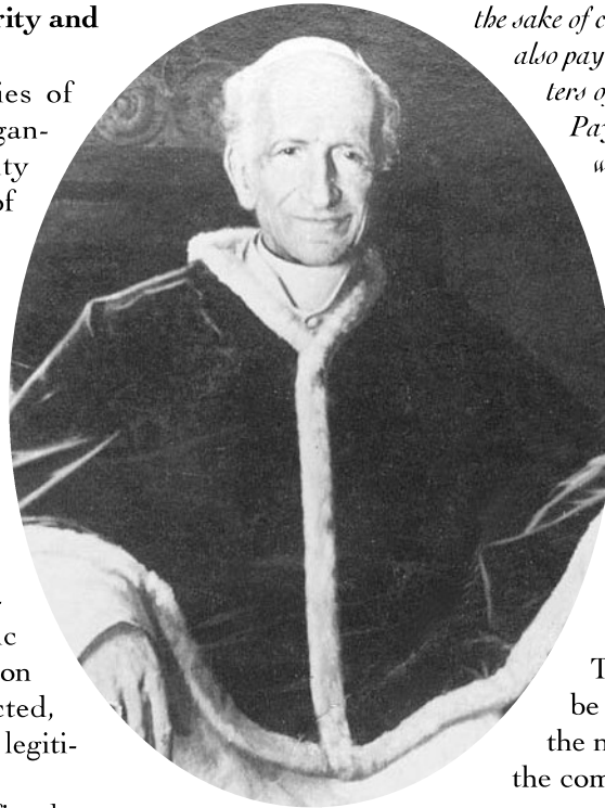
Pope Leo XIII, reigning from 1878 to 1903, issued a landmark body of teaching on the Church’s social doctrines

Civil government has been established by God to protect and promote the common good. Every human community needs authority, and all authority in civil government comes from God, as an ancient pagan king recognized: “ Thus says Cyrus king of Persia: The Lord, the God of Heaven, has given me all the kingdoms of the earth ” (Ezr 1:2). St. Paul teaches us: “ Let every person be subject to the governing authorities. For there is no authority except from God, and those that exist have been instituted by God. Therefore he who resists the authorities resists what God has appointed, and those who resist will incur judgment. For rulers are not a terror to good conduct, but to bad. Would you have no fear of him who is in authority? Then do what is good, and you will receive his approval, for he is God’s servant for your good. But if you do wrong, be afraid, for he does not bear the sword in vain; he is the servant of God to execute his wrath on the wrongdoer. Therefore one must be subject, not only to avoid God’s wrath but also for