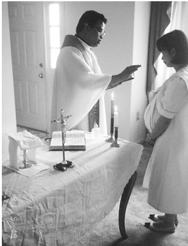
A priest blesses two souls – mother and baby

F ROM THE BEGINNING OF TIME, God created both spiritual and material creatures. Only one, humankind, is a spiritual-material creature. This means that, when creating a human person, God combines spirit and matter to form a single being who is free to know and love. To un-