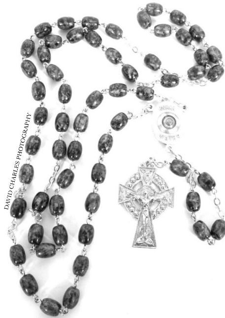
A rosary from Ireland

Glory to God in the highest, and peace to his people on earth.